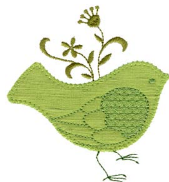
12403-11 Bird Appliqué 7 3.26 X 3.54 in. 82.80 X 89.92 mm 2,495 St.