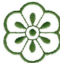
12403-23 Small Flower 1 1.38 X 1.48 in. 35.05 X 37.59 mm 1,297 St. L S