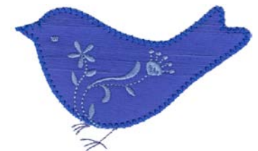
12403-12 Bird Appliqué 8 3.74 X 2.35 in. 95.00 X 59.69 mm 1,567 St.

Design contains a loose fill. Some white areas shown are not stitched.