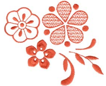
12403-16 Flowers 3.91 X 3.40 in. 99.31 X 86.36 mm 5,417 St. FF L