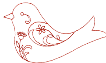
12403-07 Linework Bird 4.81 X 2.81 in. 122.17 X 71.37 mm 1,916 St.