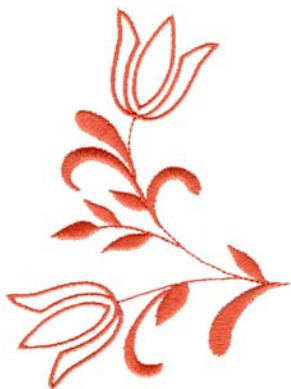
12403-21 Tulips 3.13 X 4.26 in. 79.50 X 108.20 mm 4,592 St. L