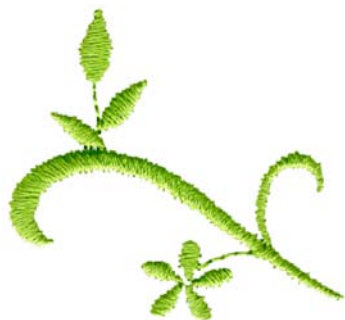
12403-09 Branch Accent 1.61 X 1.52 in. 40.89 X 38.61 mm 881 St.