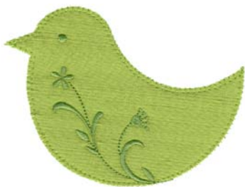
12403-05 Bird Appliqué 5 (Compatible with AccuQuilt GO! Cutter Go! Birds Die #55324) 4.51 X 3.45 in. 114.55 X 87.63 mm 1,833 St.