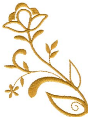
12403-22 Flower Accent 2.59 X 3.46 in. 65.79 X 87.88 mm 3,843 St. L