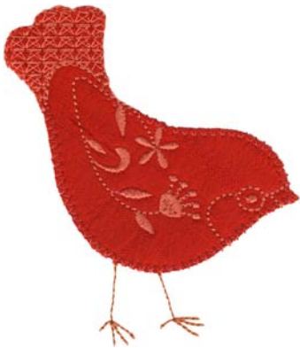
12403-13 Bird Appliqué 9 3.02 X 3.53 in. 76.71 X 89.66 mm 2,142 St.

Note: Some designs in this collection may have been created using unique special stitches and/or techniques. To preserve design integrity when rescaling or rotating designs in your software, always rescale or rotate designs using the handles directly on-screen.