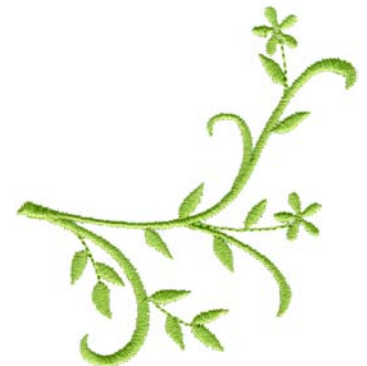
12403-08 Branch 1 2.98 X 3.23 in. 75.69 X 82.04 mm 2,890 St.