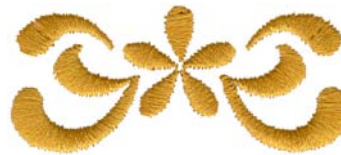
12403-19 Flower Piece 2.44 X 1.08 in. 61.98 X 27.43 mm 1,380 St. S