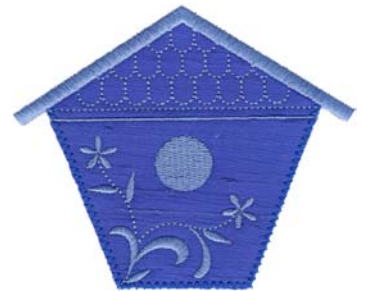
12403-20 Birdhouse Appliqué 4.13 X 3.49 in. 104.90 X 88.65 mm 4,456 St.