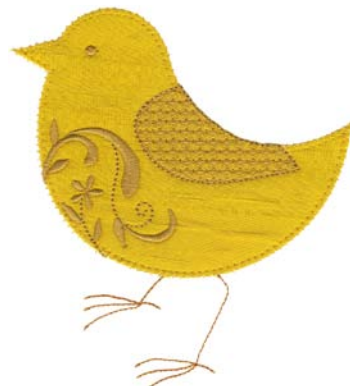
12403-06 Bird Appliqué 6 (Compatible with AccuQuilt GO! Cutter Go! Birds Die #55324) 4.46 X 5.04 in. 113.28 X 128.02 mm 3,081 St. L