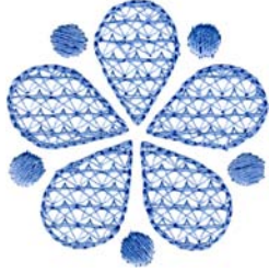
12403-25 Small Flower 3

Note: Some designs in this collection may have been created using unique special stitches and/or techniques. To preserve design integrity when rescaling or rotating designs in your software, always rescale or rotate designs using the handles directly on-screen.