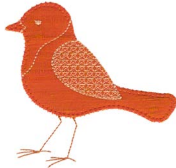
12403-14 Bird Appliqué 10 3.55 X 3.47 in. 90.17 X 88.14 mm 1,413 St.