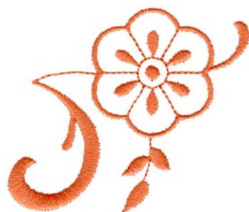
12403-10 Branch Accent 2 2.69 X 2.30 in. 68.33 X 58.42 mm 2,221 St.