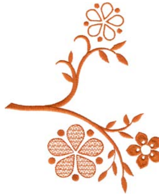
12403-15 Branch 2 Jumbo 5.05 X 6.21 in. 128.27 X 157.73 mm 8,209 St. FF L