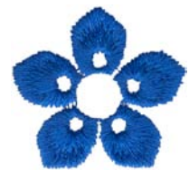
12403-24 Small Flower 2 1.23 X 1.18 in. 31.24 X 29.97 mm 1,409 St. L S

FF Design contains a loose fill. L Some white areas shown are not stitched.