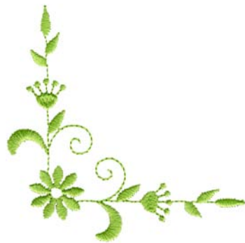
12403-18 Corner 3.24 X 3.24 in. 82.30 X 82.30 mm 2,078 St. L