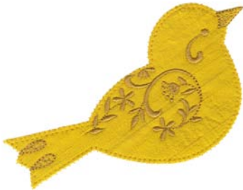
12403-01 Bird Appliqué 1 (Compatible with AccuQuilt GO! Cutter Go! Birds Die #55324) 4.64 X 3.63 in. 117.86 X 92.20 mm 3,253 St.

Note: Some designs in this collection may have been created using unique special stitches and/or techniques. To preserve design integrity when rescaling or rotating designs in your software, always rescale or rotate designs using the handles directly on-screen.