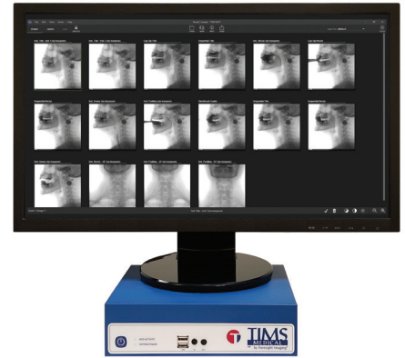
TIMS 2000 SP stationary system, part of the TIMS MVP family.

The cost of the TIMS MVP includes installation and training, which typically takes place over the course of about 1.5 days. The installers / trainers are all TIMS Medical staff.