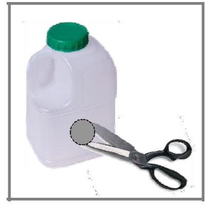
Carefully cut the windows out. Get an adult to help you.

Mark the windows on the carton, making sure they are at least 3cm from the base, so there is enough room for a twig perch.