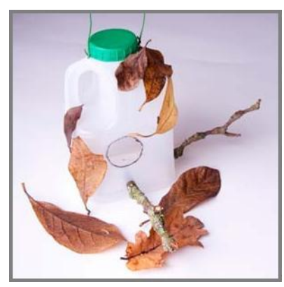
Now you can decorate or camouflage your feeder. Try coating the carton with leaves and then paint them over with PVA glue, as it will act like a varnish.