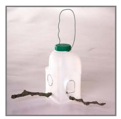
Your visitors will need to perch. Find some suitable twigs, make a small hole in the carton and push them through. Put some string or wire around the lid for hanging.

Take your milk carton and decide what feeding windows you would like to make. You can experiment with different shapes.