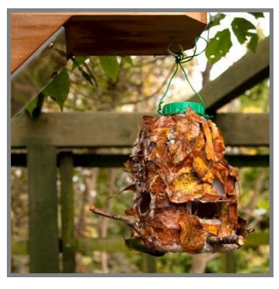
Finally, hang up your feeder and wait for the first visitor!