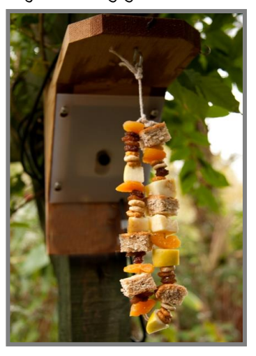
Now wait for your first visitor!