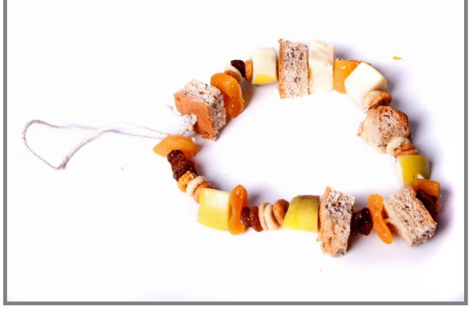
Tie your garland round in a loop, ready to hang on your feeder cam!