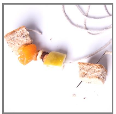
Cut a length of string and tie a knot at the end. Thread the food on carefully until you have filled your string garland.