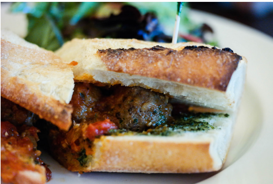
( https://www.flickr.com/photos/25259428@N08/13901322466 )