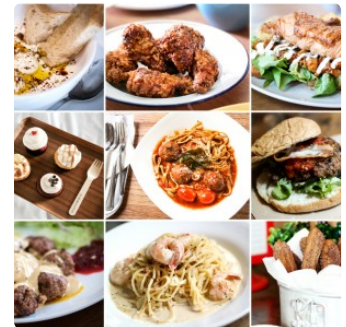
( https://www.misstamchiak.com/20-halal-cafes-in-singapore/ )