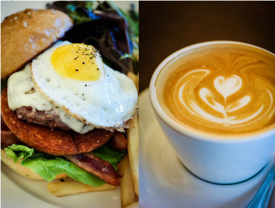
( https://www.flickr.com/photos/25259428@N08/13901358561/ )