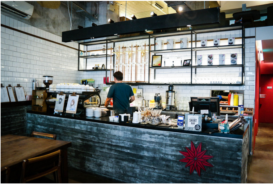
( https://www.flickr.com/photos/25259428@N08/13901323902/ )