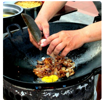
( https://www.misstamchiak.com/malacca-food-guide/ )