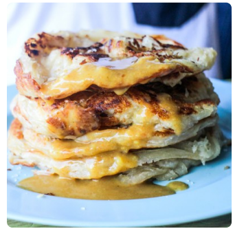
( https://www.misstamchiak.com/good-food-near-jb-checkpoint/ )