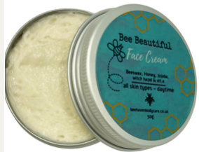
Bee Beautiful Face Cream