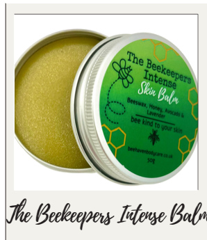
The Beekeepers Intense Balm

Step 3 evening: Apply The Beekeepers Intense Skin Balm . Melt a little between the hands (a little goes a long way!), massage the melted balm into the face and neck. The product will gradually sink in as you sleep.