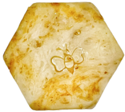
Let's Bee Facial Soap