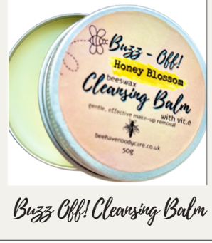
Buzz Off! Cleansing Balm

In addition to the products I mention below I would also recommend that you drink at least 2 litres of water daily, reduce your sugar intake and eat foods rich in good bacteria (probiotic foods - google it - life changing).