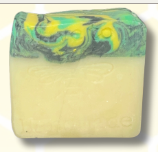
Caribbean Melon Soap

Pineapple Soap A vibrant pineapple scented, skin nourishing, beeswax soap. £5.99