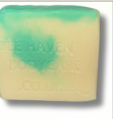
Goats Milk Soap

Champa Flower Soap : A tallow based body soap with notes of orange-flower, ylang-ylang and tea rose, combined with a tinge of rich spiciness. £5.99