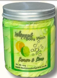
Lemon & Lime Whip

Lemon Conditioner: A deep conditioner, handmade by us using natural ingredients. With a coconut fragrance. Great for all hair types, and for those people who have dry scalp. £9.99