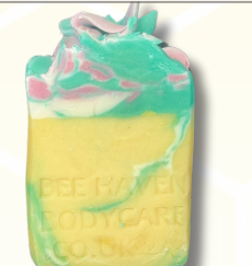
Champa Flower Soap

Caribbean Melon Soap : An exotic twist of sweet mangos and succulent strawberries. £5.99