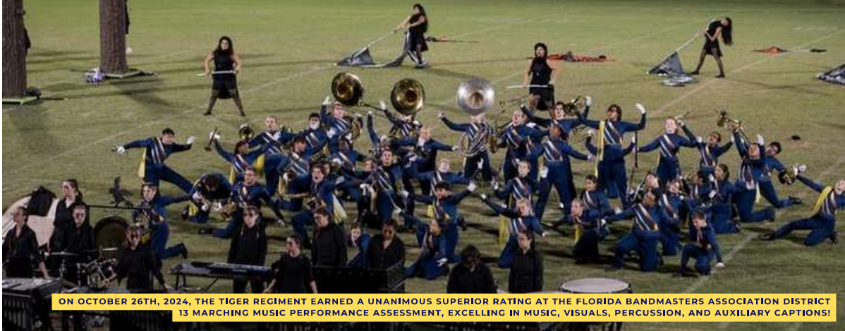
ON OCTOBER 26TH, 2024, THE TIGER REGIMENT EARNED A UNANIMOUS SUPERIOR RATING AT THE FLORIDA BANDMASTERS ASSOCIATION DISTRICT 13 MARCHING MUSIC PERFORMANCE ASSESSMENT, EXCELLING IN MUSIC, VISUALS, PERCUSSION, AND AUXILIARY CAPTIONS!