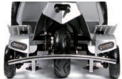
Quintell™ Self Centering Steering Defaults to straight travel with minimal effort