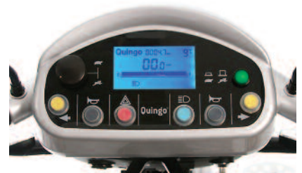
Multi-feature digital dash/LCD display Easy to read layout and controls