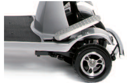
Quintell™ Adaptive Footplates Adjustable to match your measurements