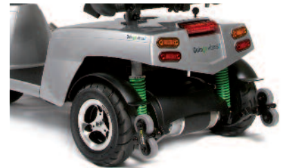
Long Travel Suspension & Kerbmaster Anti-grounding & Anti-tipping Smoother and safer journeys with style