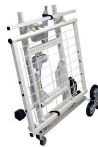
Transport Dolly and Stair Climber