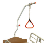
Trapeze Patient Helper