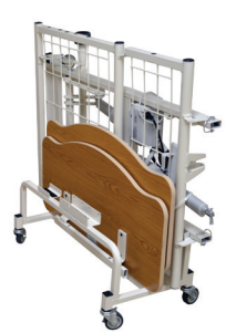
Storage and Transport Cart