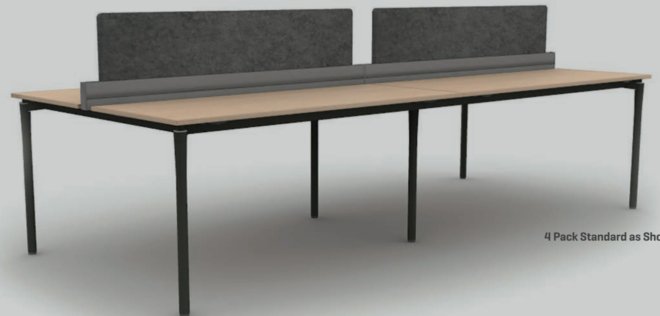
4 Pack Standard as Shown