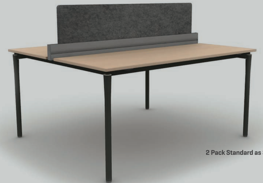
2 Pack Standard as Shown