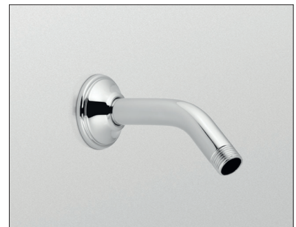
TS200N6: Shower Arm 6"

Please note the following component is sold separately: