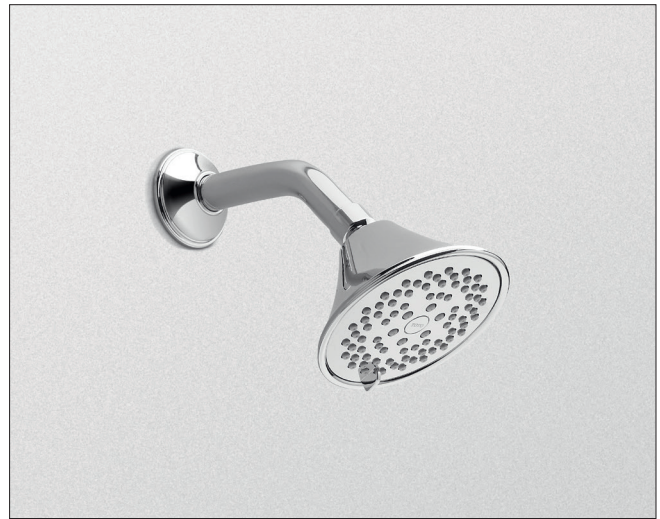
TS200A55: Transitional Series A Multi-Spray Showerhead 4-1/2"

The multi-spray showerhead shall have a maximum flow rate of 2.5 gpm (9.5 lpm). TS200A55 shall have a 4-1/2" showerhead and a 4" diameter spray face. TS200A65 shall have a 5-1/2" showerhead and a 5" diameter spray face. Product shall have 5 multifunction spray modes. Spray modes shall be spray, spray and massage combo, massage, mist and pause. Product shall have rubber nozzles to prevent limescale build up. Product shall be TOTO Model TS200A____ #____.