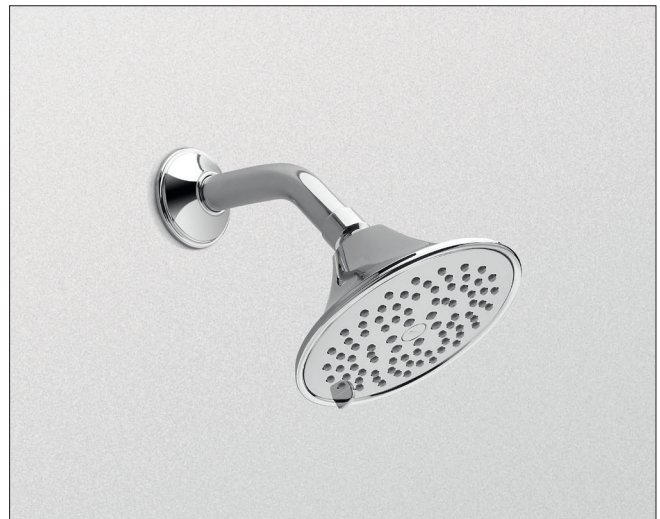
TS200A65: Transitional Series A Multi-Spray Showerhead 5-1/2"

Please note the following component is sold separately: