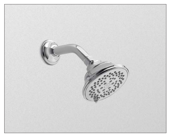
TS300AL55: Traditional Collection Series A Multi-Spray Showerhead 4-1/2"

The multi-spray showerhead shall have a maximum flow rate of 2.0 gpm (7.6 lpm). TS300AL55 shall have a 4-1/2" showerhead and a 4" diameter spray face. TS300AL65 shall have a 5-1/2" showerhead and a 5" diameter spray face. Product shall have 5 multifunction spray modes. Spray modes shall be spray, spray and massage combo, massage, mist and pause. Product shall have rubber nozzles to prevent limescale build up. Product shall be TOTO Model TS300AL____#____.