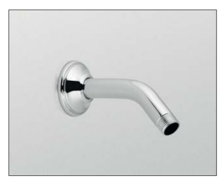
TS300N6: Shower Arm 6"