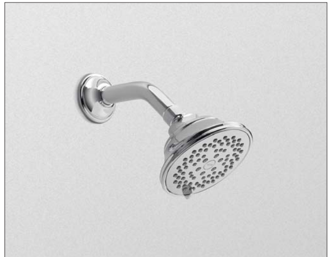
TS300A55: Traditional Collection Series A Multi-Spray Showerhead 4-1/2"

The multi-spray showerhead shall have a maximum flow rate of 2.5 gpm (9.5 lpm). TS300A55 shall have a 4-1/2" showerhead and a 4" diameter spray face. TS300A65 shall have a 5-1/2" showerhead and a 5" diameter spray face. Product shall have 5 multifunction spray modes. Spray modes shall be spray, spray and massage combo, massage, mist and pause. Product shall have rubber nozzles to prevent limescale build up. Product shall be TOTO Model TS300A____ #____.