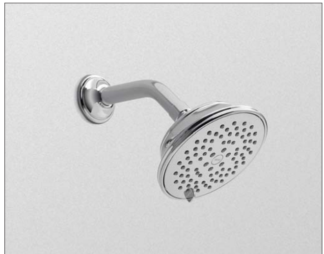
TS300A65: Traditional Collection Series A Multi-Spray Showerhead 5-1/2"

Please note the following component is sold separately: