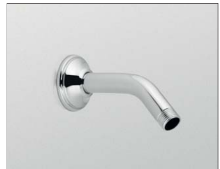
TS300N6: Shower Arm 6"

Please note the following component is sold separately: