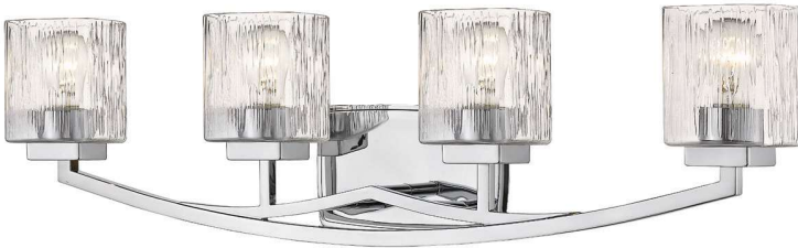
| I |