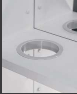
HAIR DRYER HOLDER