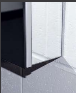
SIDE MIRROR KIT FOR SURFACE MOUNTING OR SEMI-RECESSING