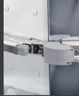
CONCEALED, BLUM® SOFT-CLOSE HINGES