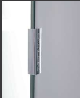
UNDERSTATED ALUMINUM HANDLE