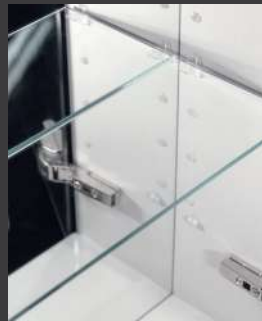
5 ADJUSTABLE GLASS SHELVES