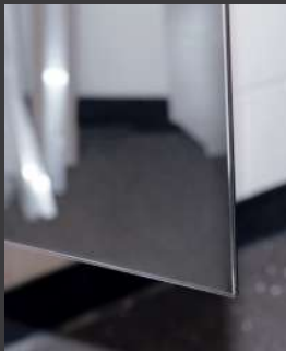
SILVERLASTING™ DOUBLE SIDED MIRROR DOOR