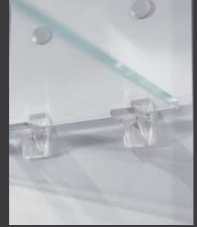
SHELF ADJUSTMENT SYSTEM