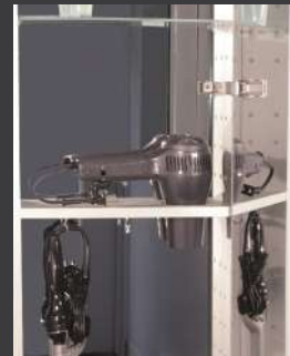
FUNCTIONAL STORAGE SOLUTION