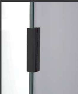
UNDERSTATED BLACK MATTE HANDLE