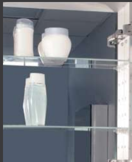
MIRRORED CABINET BACK WALL