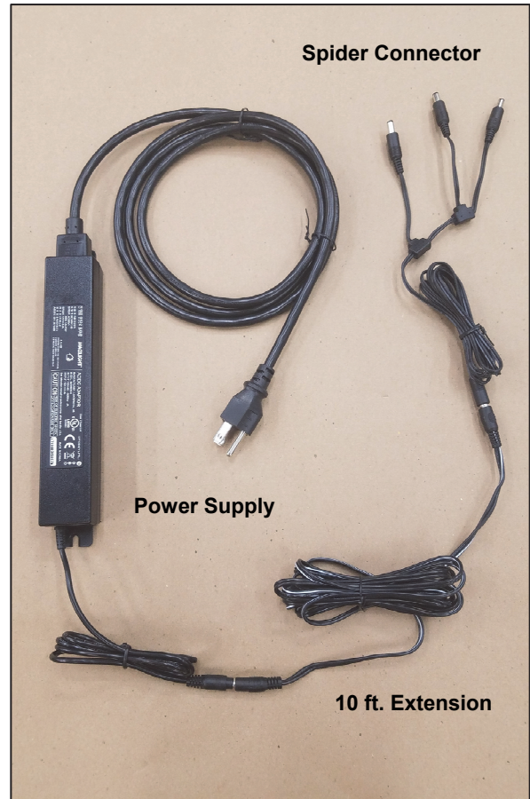
Figure 2. Spider connector, 10 ft. extension and plug-in power supply.