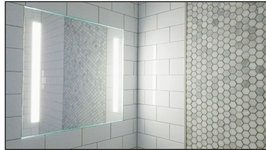
Figure 4. Grout around the mirror to seal and finish.

Caulk or grout around the edges. See Figure 4.