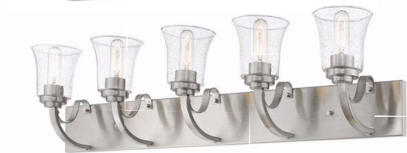
| I |