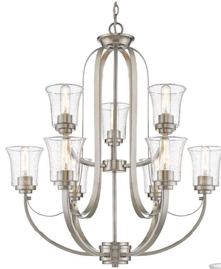
| A |