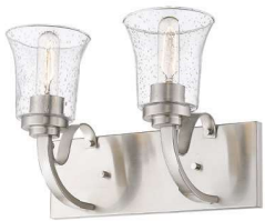
| F |