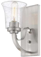
| E |

The ribbon inspired curved arms of the Halliwell collection, when paired with Seedy glass shades, create a look of elegant simplicity. Available in both Brushed Nickel and Bronze, these fixtures will add sophistication to your home.