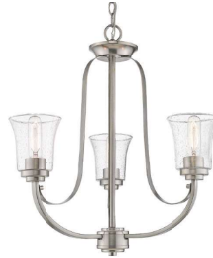
| C |