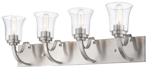
| H |