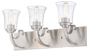
| G |