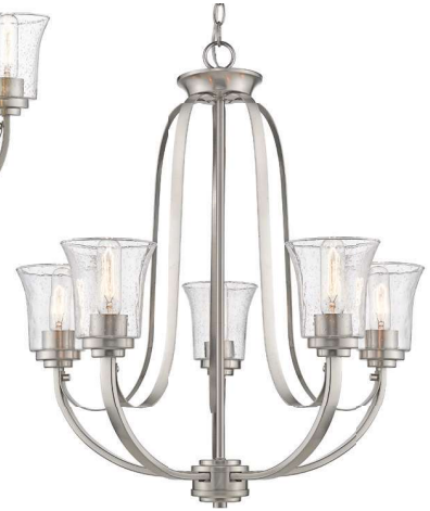
| B |