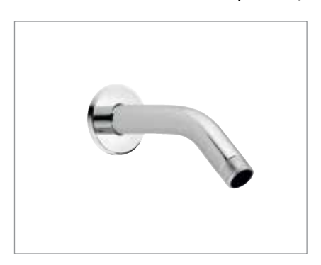
TBW01012UV1: Modern Shower Arm