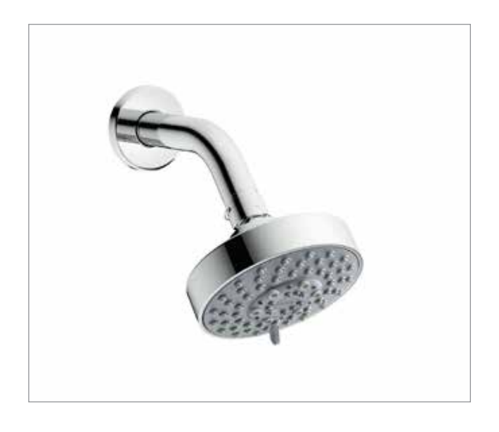
Please note the following components are sold separately

Product shall be TOTO Model TBW01013U4#____. Product shall have a maximum flow rate of 1.75 gpm (6.6 lpm). Product shall have a multiple spray. Product shall have rubber nozzles to prevent limescale buildup. Product shall have G 1/2 thread connection compatible with 1/2 NPT. Product shall meet 2018 California water efficiency appliance CEC regulations. Product shower arm sold separately.