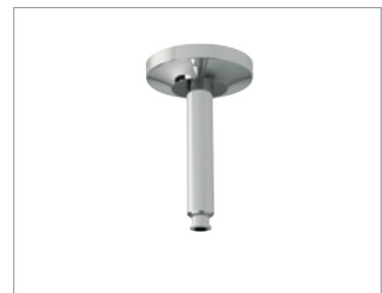
TS110MC6: Rain Shower Arm Ceiling Mount 6"