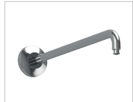
TS110MW16: Rain Shower Arm Wall Mount 16"

Please note the following components are sold separately