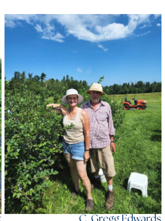
And we have now more than 9 members in our collective!