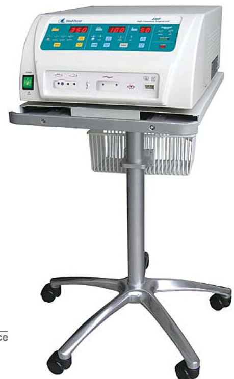
EB03 (Cart for Option Only)