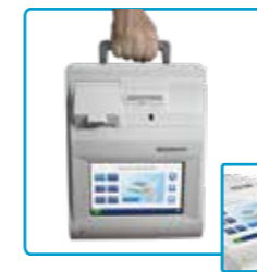
Portable and lightweight