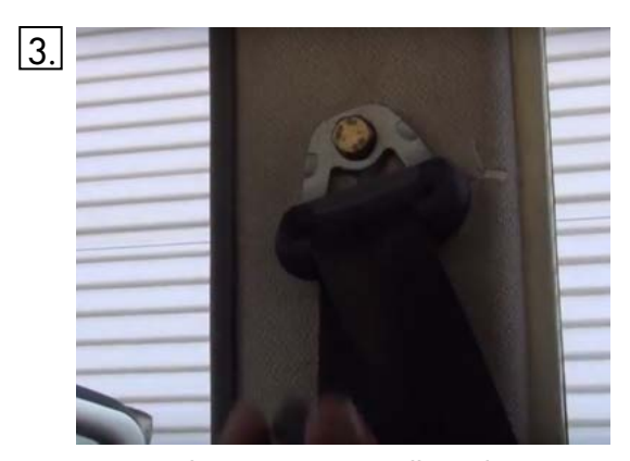
Remove the D-Ring. You will need to remove the cover to access the bolt.