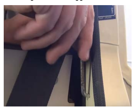
Rotate the guide bar up and pull it out.