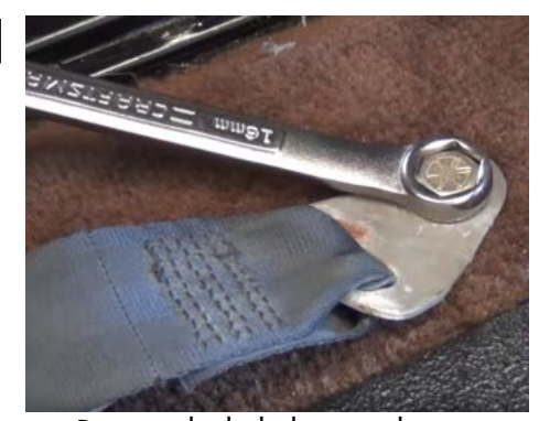
Remove the bolt down end.