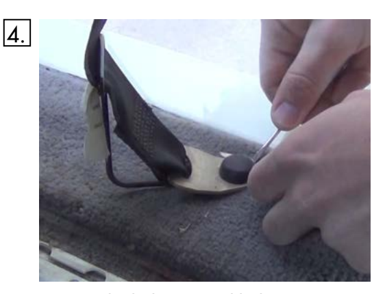
Remove the bolt cap, and bolt to remove the belt end from the seat pedestal