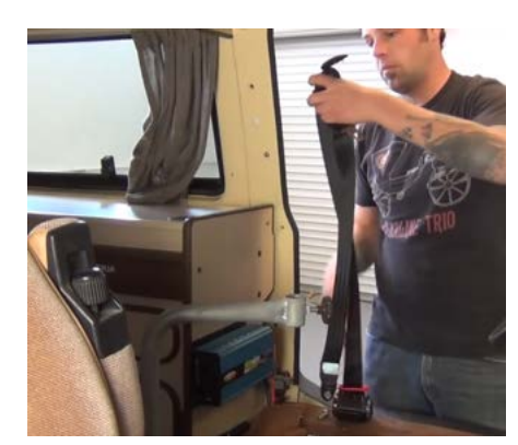
Install your new belt in reverse of removal. Torque all bolts to 35 lb-ft.