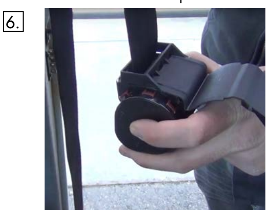
Remove some slack from the new reel. It will not unravel unless it is in an upright, vertical position.