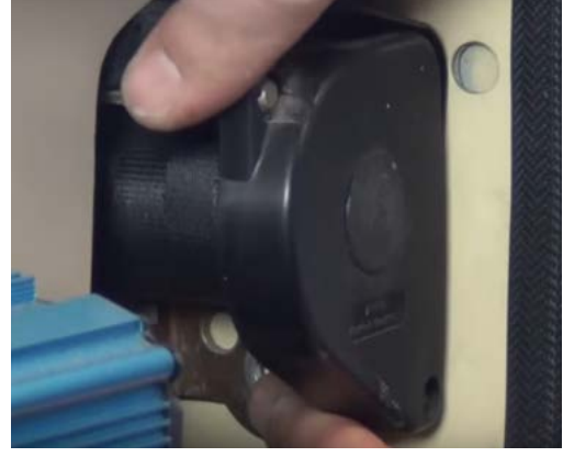
Pull the webbing out of the reel to easily access the bolt. Remove the bolt, and unsnap the cover to provide enough room to wiggle the reel out.