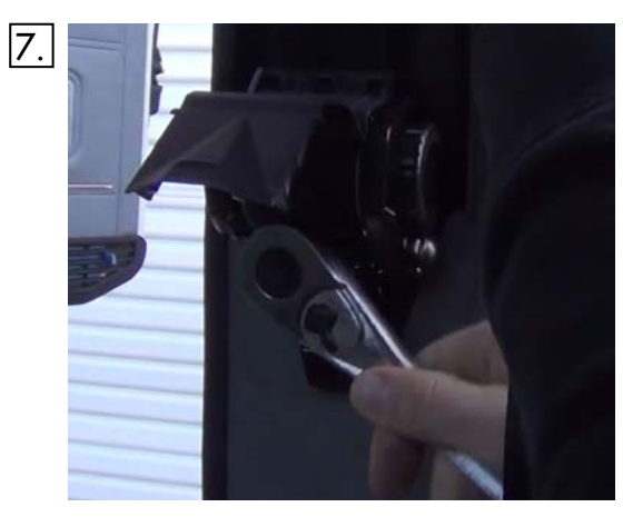
Bolt the new reel in, taking care to ensure it is vertically straight. Torque the reel bolt to 35 lb-ft