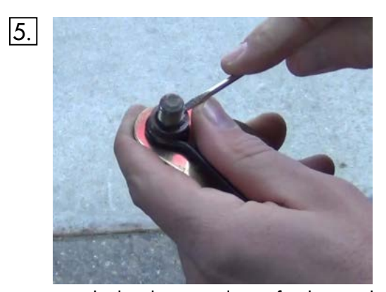
Remove the hardware and save for the new belt. The plastic ring may need to be cut or pried off to remove the hardware.