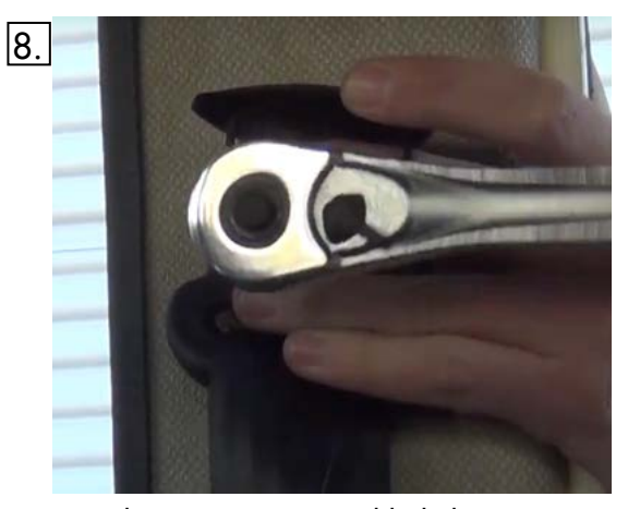
Unsnap the D-Ring cover and bolt the D-Ring in place. Be sure the mounting hole is squared on the shoulder of the bolt, so it pivots freely. Torque to 35 lb-ft