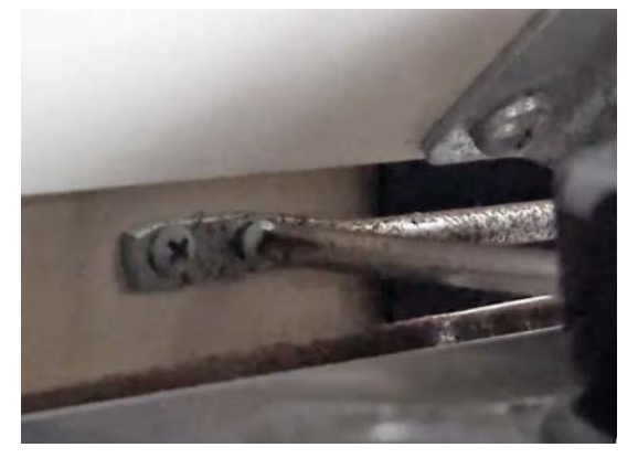
Lift the lid and unscrew the guide bar.