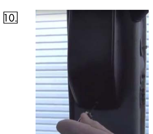
Reinstall the reel cover.

If you have a full camper, see the next page, otherwise repeat for the drivers side, and you are done!