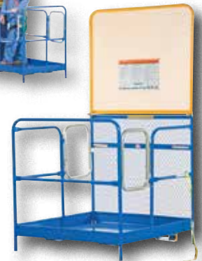
DUAL SIDE DOOR ENTRY 16" Wide Doors (shown with 84" high back) series WP-DD