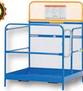
SINGLE SIDE DOOR ENTRY series WP