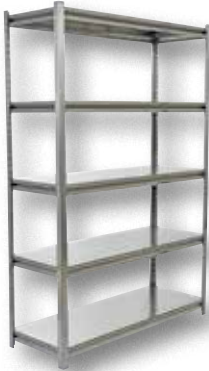
Easy assembly. Units set up fast!