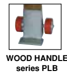
WOOD HANDLE series PLB