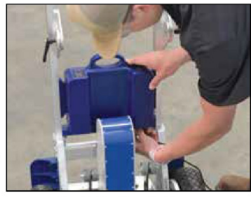
Easily Replace Battery for Continuous Use