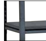
Easy assembly. Units set up fast!

Boltless design ensures fast assembly and adjustment while the textured powder coat surface resists rust and scratches. Each model includes five adjustable 17 gauge industrial strength steel shelves. Shelf heights are adjustable in 1½" increments. Unit features four sided access. Units ship knocked down.