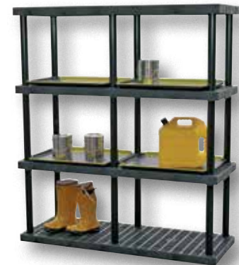
model PBSS-6624-4 with Optional Yellow Plastic Shelf Containment Tray model PBSS-YLTRY