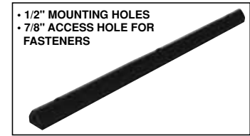
TYPE A • M-2-SERIES