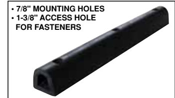
TYPE B • M-4-SERIES