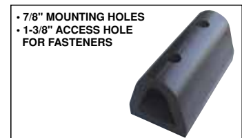
TYPE C • M-6-SERIES