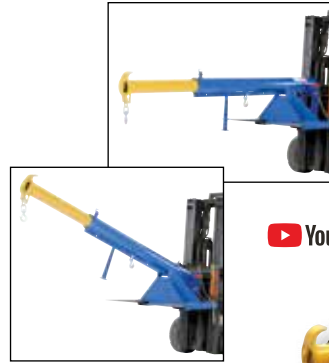
ORBITING BOOM model LM-OBT-4-24

Unique performance, convenience, and safety features are built into every Lift Master Boom. Fabricated from structural steel with welding to meet AWS creates a rugged and durable boom that will provide long term service. Telescopic units come with an infinitely adjustable locking screw (except orbit booms which feature a locking detent). Fork pockets for 4,000 pound uniform capacity models measure 7½"W x 2½"H usable on 24" centers. Usable fork pockets are 7¼"W x 2¼"H for 6,000 and 8,000 pound uniform capacity models. Optional fork pocket centers available, contact factory. A safety restraint secures the boom to the fork truck for safe operation. Each unit includes two lifting hooks.