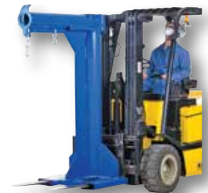
HIGH-RISE BOOM model LM-HRNT-4-24