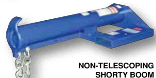
NON-TELESCOPING SHORTY BOOM model LMS-EBNT-40-4