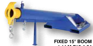
FIXED 15° BOOM model LM-F15-4-24