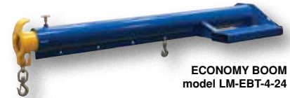
ECONOMY BOOM model LM-EBT-4-24