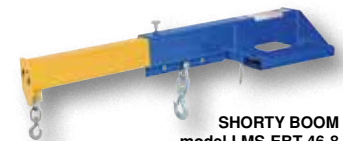
SHORTY BOOM model LMS-EBT-46-8