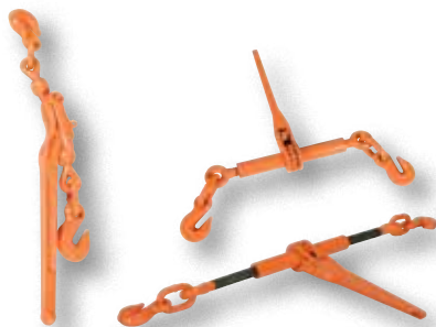
RATCHET TYPE model LBDR-9-L