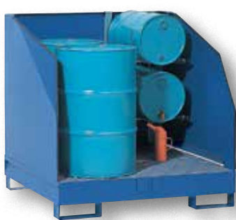
model VSRB-WS-4 shown with model VSRB-SA