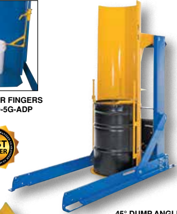
45° DUMP ANGLE (135° TOTAL ROTATION)