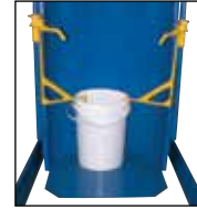
PAIL ADAPTOR FINGERS model HDD-5G-ADP

OPTIONAL 12VDC SYSTEM WITH 115V ON-BOARD CHARGER, MODEL VCC-12VDC OPTIONAL 5 GALLON PAIL ADAPTOR FINGERS, MODEL HDD-5G-ADP