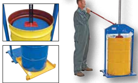
ROLL-OUT BASE ASSEMBLY model MTC-RB