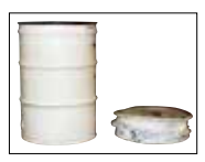
Crushes 55 gallon steel drums to only 6" high.