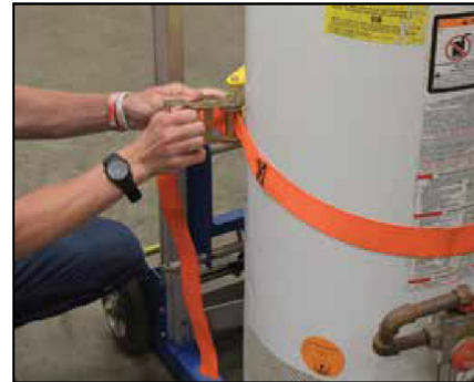
Ratchet Strap Helps Secure Tank