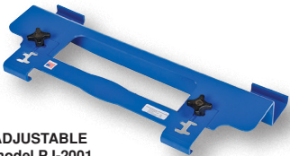
ADJUSTABLE model PJ-2001