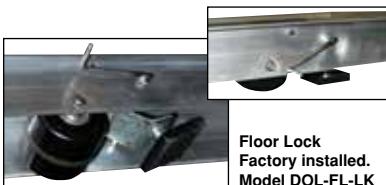
Floor Lock Factory installed. Model DOL-FL-LK