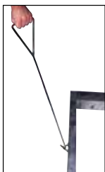
Loops and Handle work great for pulling. Includes one loop at each end of dolly and one handle. Factory installed. Model DOL-HDL