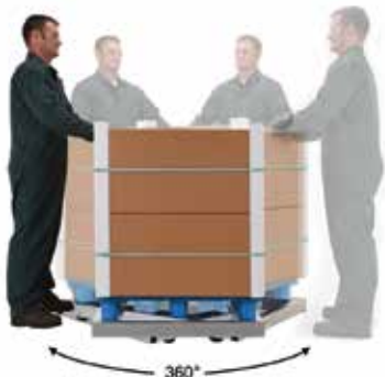
Tilt style allows for spinning on center line axis.