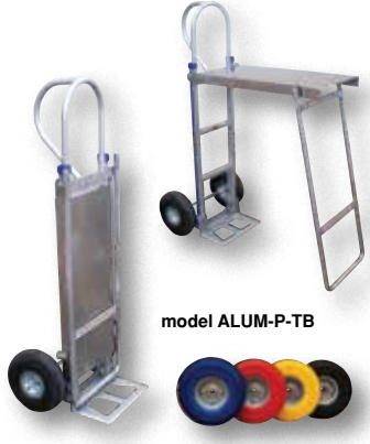
SUFFIX "UF" STANDS FOR URETHANE SOLID FOAM WHEELS