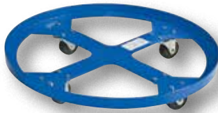
OVERPACK DRUM DOLLY series DRUM-SP