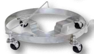
model DRUM-DRH-HR-TLT includes a 36" metal handle.