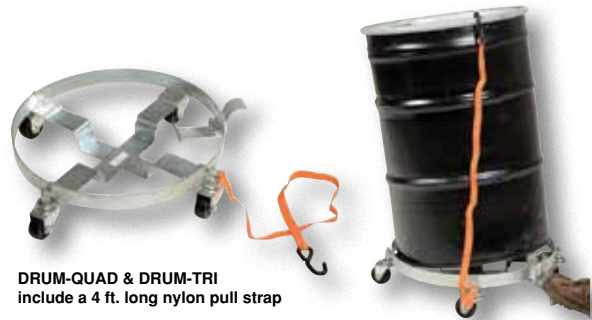
DRUM-QUAD & DRUM-TRI include a 4 ft. long nylon pull strap

DRUM-DRH-HR-TLT , will transport 5 gallon pails and 30 or 55 gallon drums.