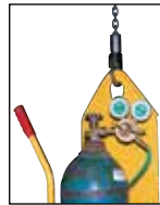
Raise with hoist, lift with fork truck, or manually push around.

Designed for transporting cylinders and cutting torch. Includes two (2) tank compartments with heavy-duty ratchet straps. Brackets are included for holding cutting torch and hose. Sturdy handles and large 16" diameter wheels for tilt-n-go portability. Heavy-duty uniform capacity rating is 500 pounds. Convenient open-top storage tray included on all CYL-E series carts only. CYL-2 models include lockable storage box for regulators. Box includes hose opening so regulator does not need to be disconnected for storage. Lifting eye is 2" maximum diameter, material thickness is 7/16". Fork pockets for transportation is included on CYL-2 models. Usable size of each fork pocket is 7½"W x 2 3 / 16 "H. Units with fire protection include ½" (approximately 13mm) marineite 1 material, which provides a 30 minute fire protection barrier as described by OSHA standards 1910.253 and 1926.350. Welded steel construction with a yellow, baked-in powder-coated toughness. Not designed for use as a storage means for gas cylinders.