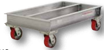
2,000 LB. CAPACITY UNITS