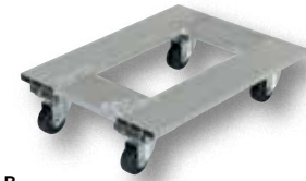
900 LB. CAPACITY UNITS

*HR = HARD RUBBER / POLY = POLY-ON-STEEL