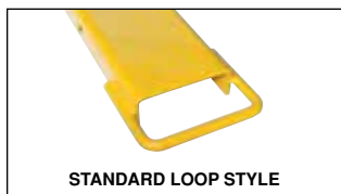
STANDARD LOOP STYLE