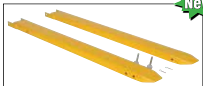
PIN STYLE • Suffix P

HOT DIPPED GALVANIZED FINISH SHOWN. OTHER SPECIALTY FINISHES AVAILABLE, CONTACT FACTORY.