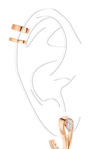
High Position & Low position