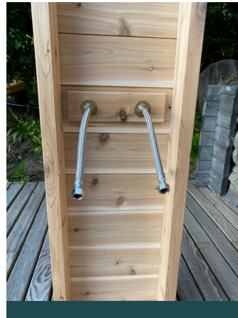
11. For hot/cold water, have your plumber use braided supply hoses to connect to water sources.