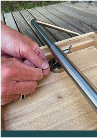
5. Using provided hex wrench, tighten the set screw to the shower stem.