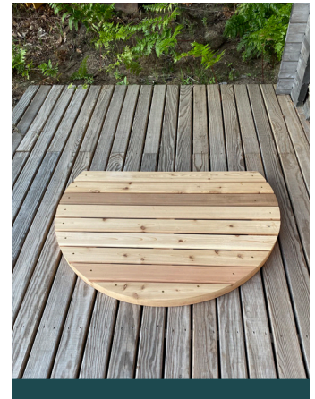
12. You can screw the shower section to the deck or to a wall, whichever is preferred. If using the optional floor section, place the floor at the desired location.