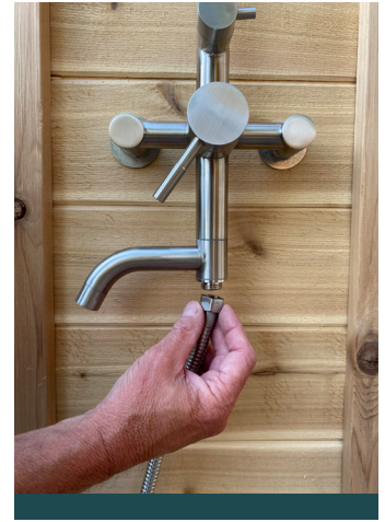
8. Twist the hand wand on to the hose and the hose to the base of the valve assembly.