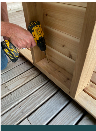
13. Screw the shower section to the floor section to stabilize the unit.