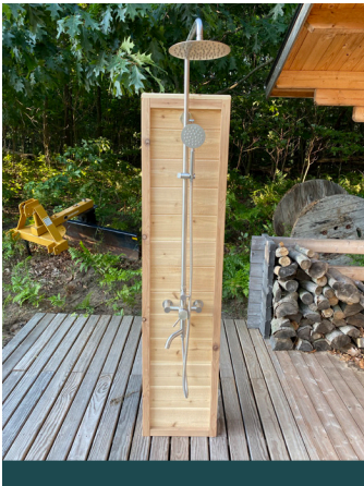
9. Lift the shower upright so it appears as shown.