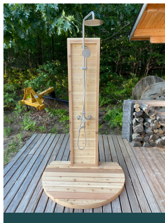
14. Your completed shower!