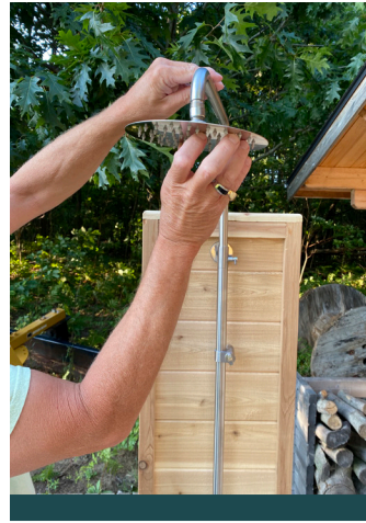
7. Twist the overhead shower head onto the stem assembly.