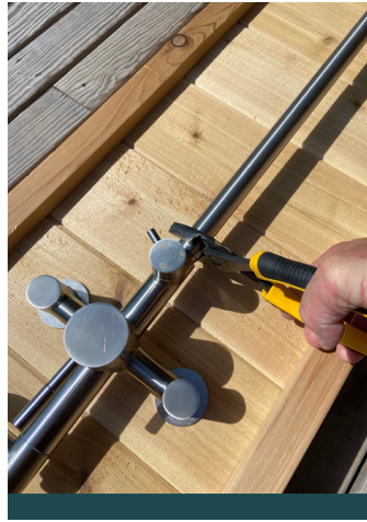
6. Using a pliers, tighten the nut that secures the shower stem to valve assembly.