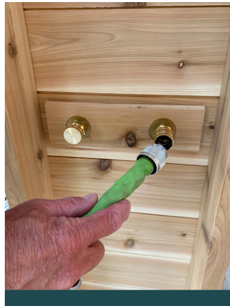
10. For cold water only attach the garden hose to one of the inlets on the back of the shower section and cap the other side with the included cap.