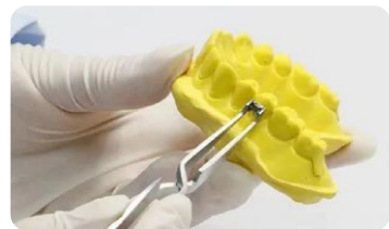
1. Bond the brackets to the plaster model temporarily