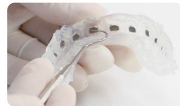
3. Remove temporary adhesive from brackets