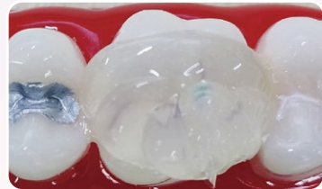
4. Press with the transparent stamp