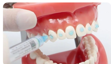
4. Prepare teeth, etch and apply adhesive