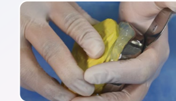
4. Use Regular Body to make transparent matrix