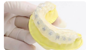
2. Apply regular body to make transparent guide