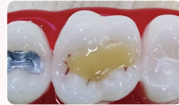
3. Fill with flowable resin or bulk resin