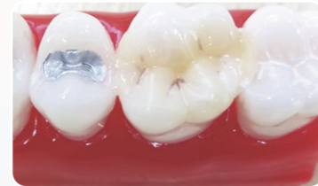
6. Finish restoration after polishing