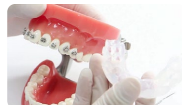
6. Complete one-time transfer brackets