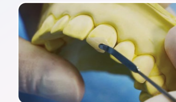
2. Finish restoration with wax on plaster model