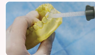
3. Apply Regular Body to the plaster model