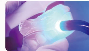
6. Light cure the resin materials