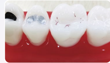
2. Prepare teeth, etch and apply adhesive