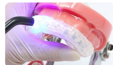
5. Apply the transparent matrix. Light cure the adhesive