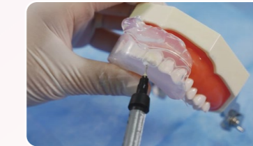
5. Fill the space with light-curing resins