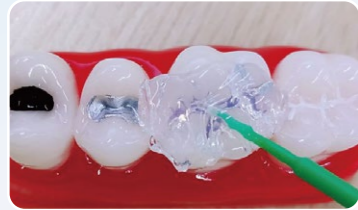
1. Use Regular Body to make transparent stamp