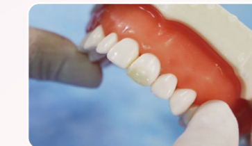
7. Finish restoration after polishing