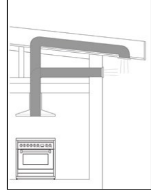
Eave or Wall ducted