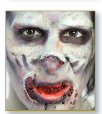
Patch test recommended. Remove with Mehron Makeup Remover followed by soap and water.

Brush and Bloody Rose makeup, fill in the holes torn into the Liquid Latex. Stipple Midnight Sky onto and around the lips. Dab Maize yellow and Bloody Rose around the face and neck to create a bruised, decaying skin effect. Using the Brush and the mixed Midnight Sky and Bloody Rose paint, create 3 smudges on the cheeks as shown to give a more hollowed out effect. Add White to highlight any protruding areas.