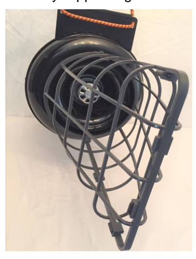
securely clipped together.

See here the frame is properly fitted to the fan unit now with all of the clips secured.